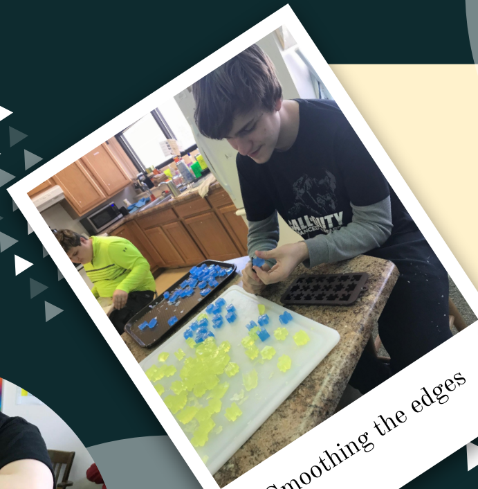
Smoothing the edges