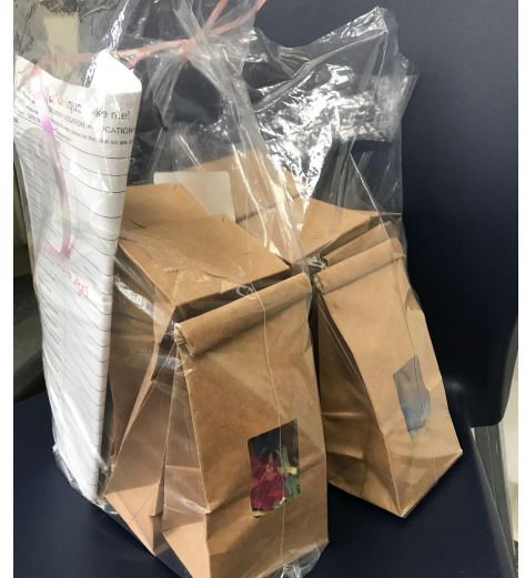
Ready for delivery

using measuring cups and spoons counting money running microwave following a recipe learning social skills learning to ask for help and/or supplies learning to work beside others and share supplies