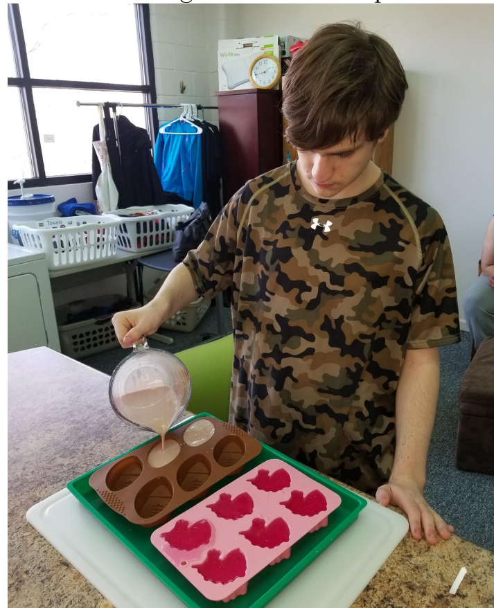
Pouring into molded soap