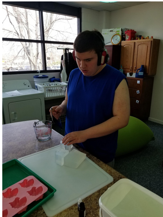
Prepping the soap base