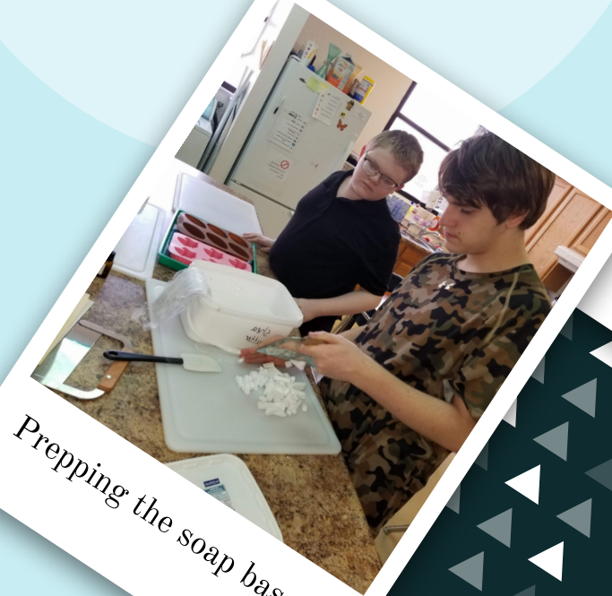
Prepping the soap base